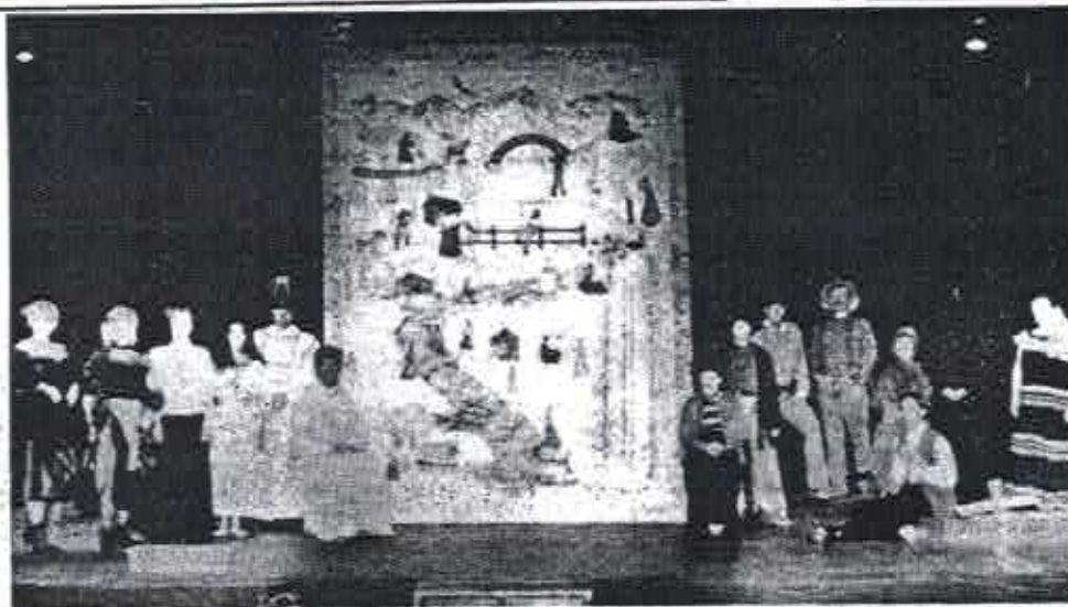
The cast of "Across the Great Divide" hold a dress rehearsal under a re-creation of the tapestry that inspired the playwright.

THURSDAY, AUGUST 20, 1998 WESTCLIFFE, COLORADO 81252 SINCE 1883 VOL. 115 NO. 14