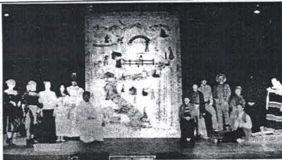
The cast of "Across the Great Divide" hold a dress rehearsal under a re-creation of the tapestry that inspired the playwright.

THURSDAY, AUGUST 20, 1998 WESTCLIFFE, COLORADO 81252 SINCE 1883 VOL. 115 NO. 14